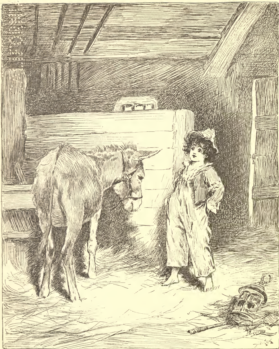
"SO HE WENT TO SHOW IT HIS TROUSERS."